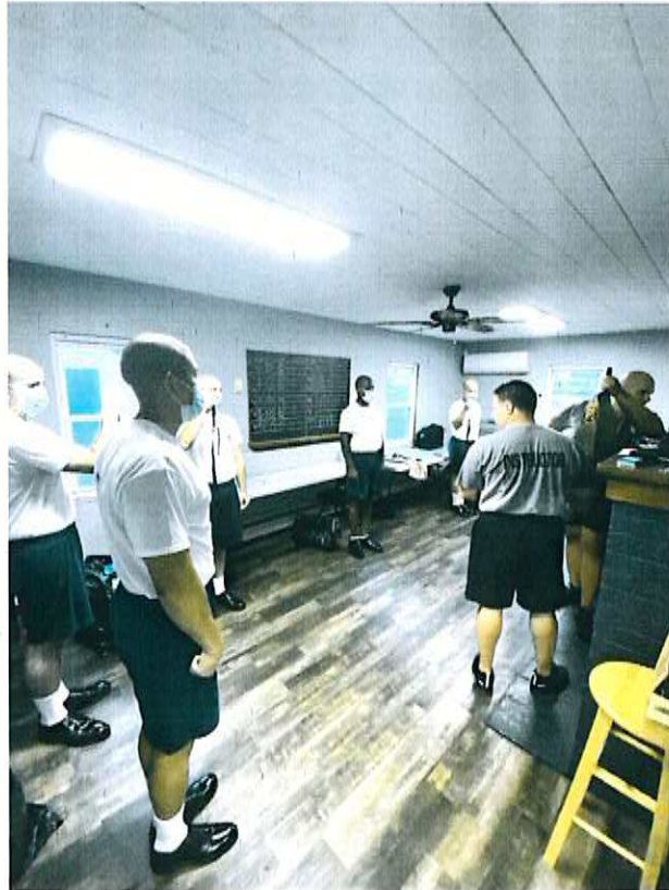
Pre-Academy Training Program