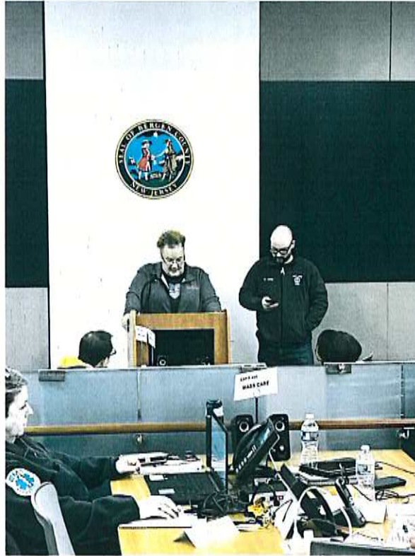
Complex Coordinated Attacks - Command Training