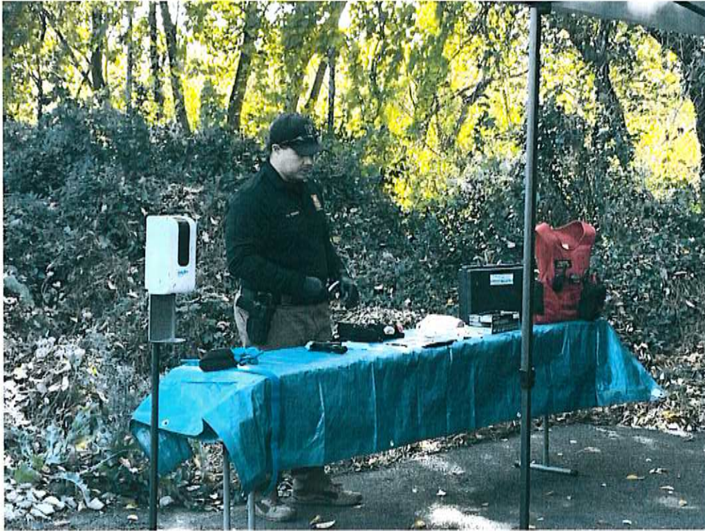
Combat Casualty Care ... wound packing, tourniquet applications, chest seals