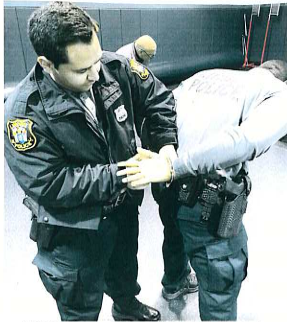
ARCON Arrest and Control Training