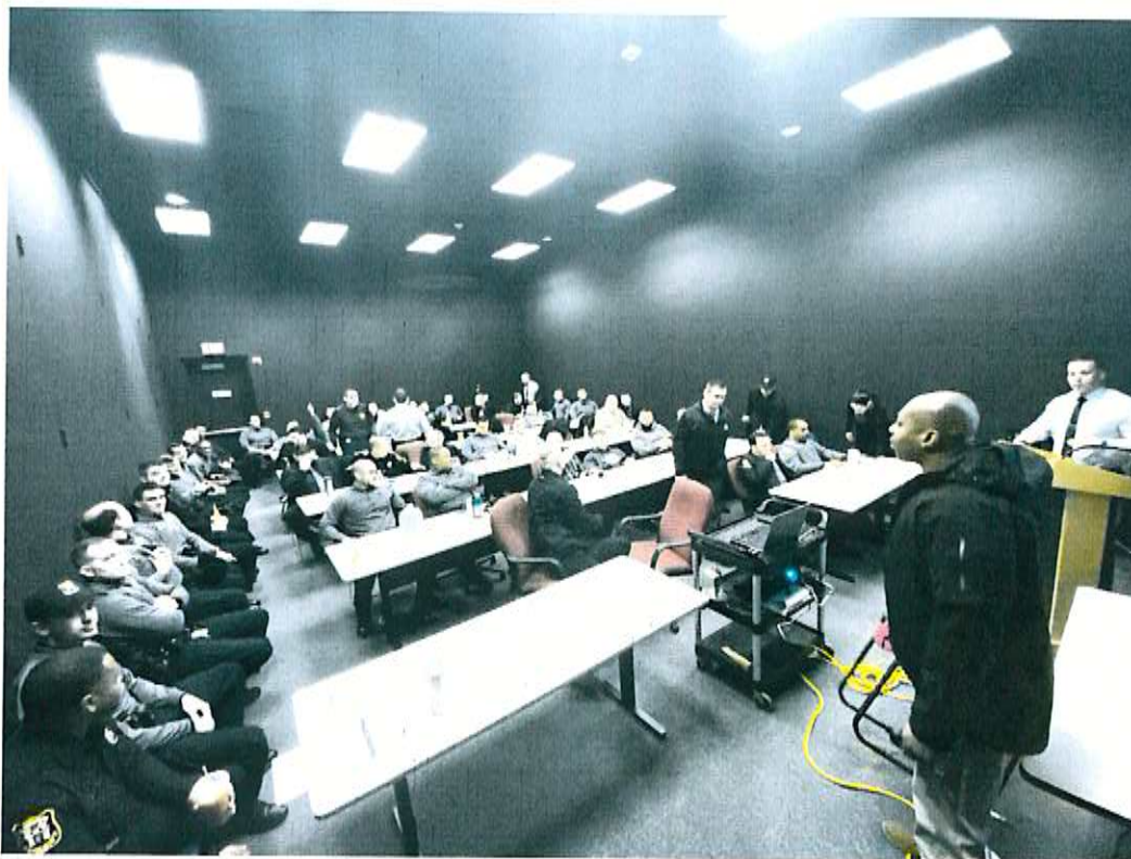
Legal Update Search & Seizure