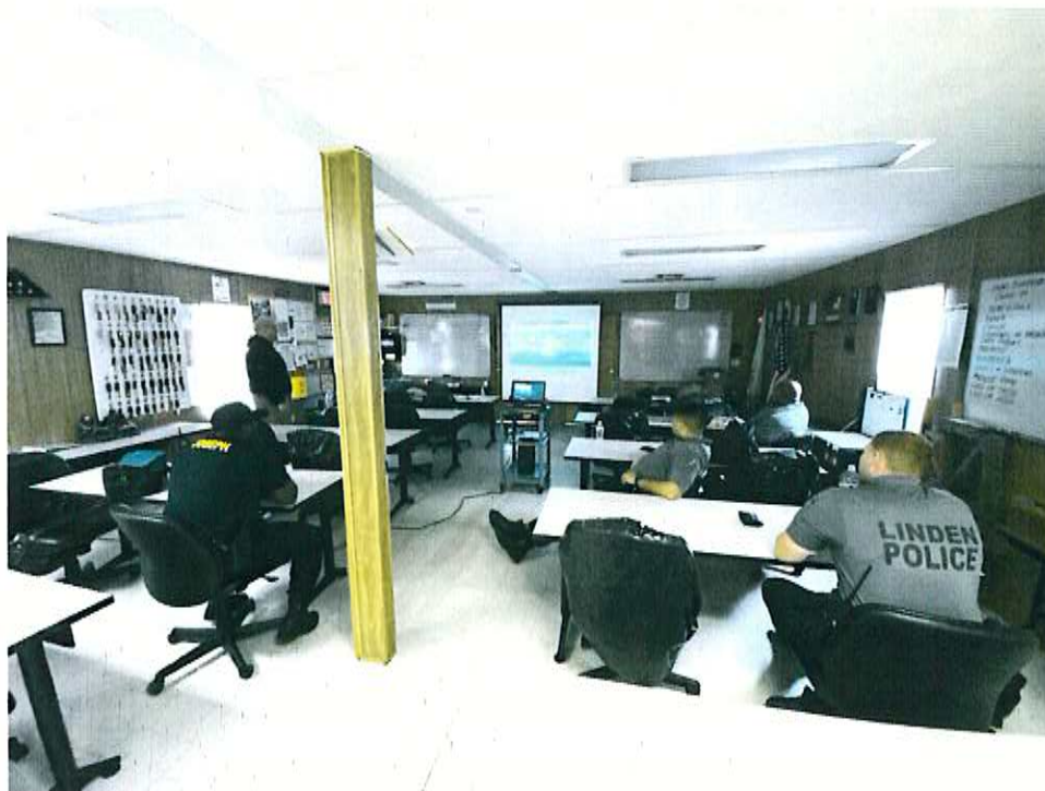
De-escalation Training & Critical Communications