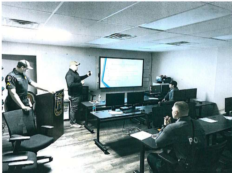
Shoplifting Legal Review Probationary Officer Training