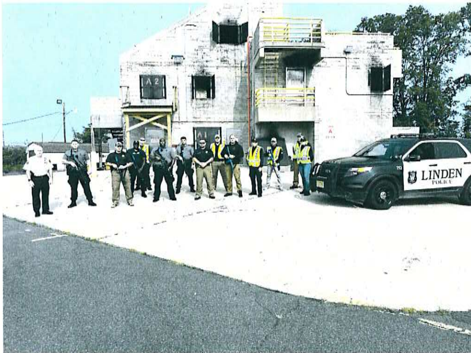
Active Threat Training