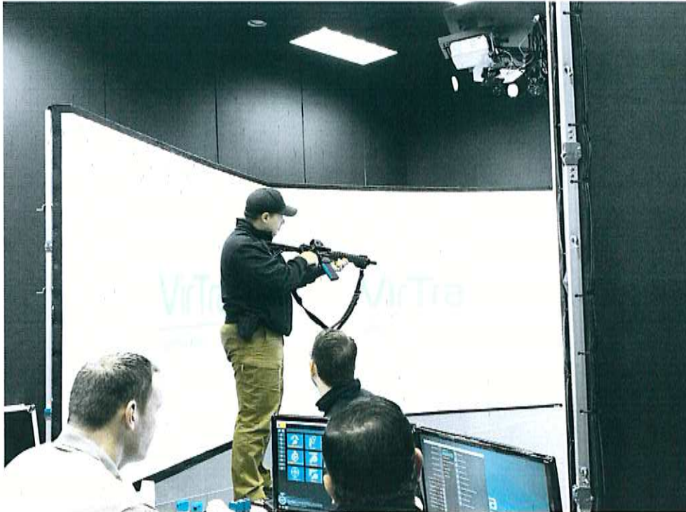
VirTra Firearms Simulation Training