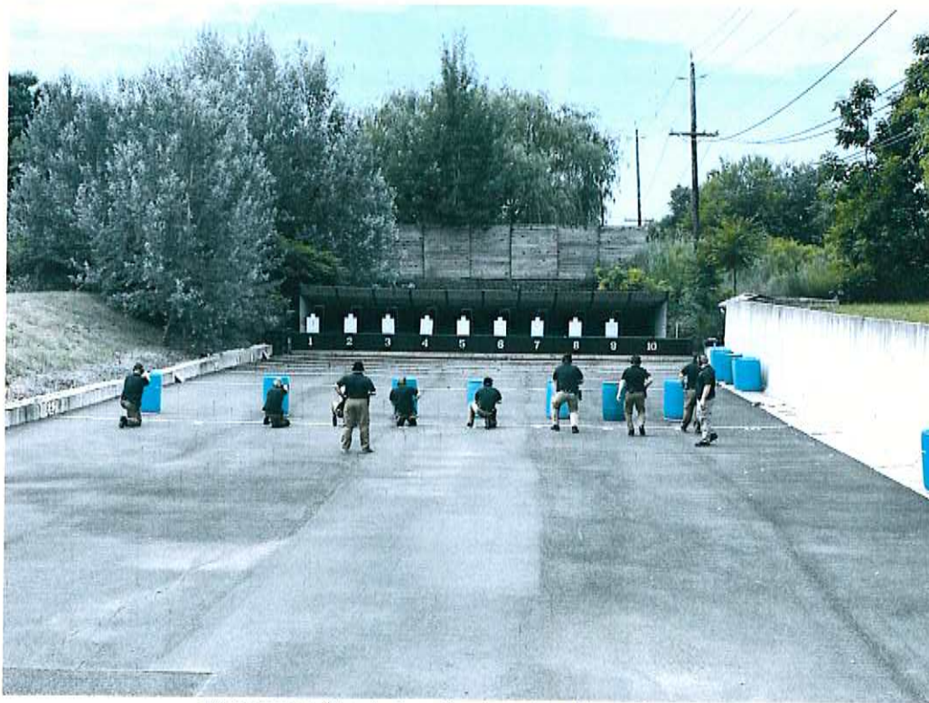
Firearms Training Instructor Development