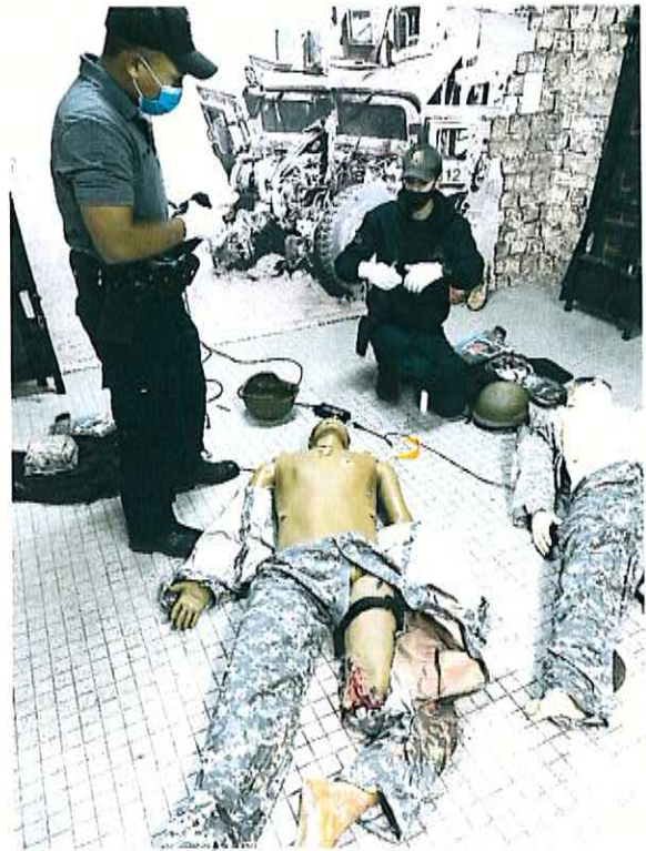
U.S. Army Support Activity Group MCTC Training Facility