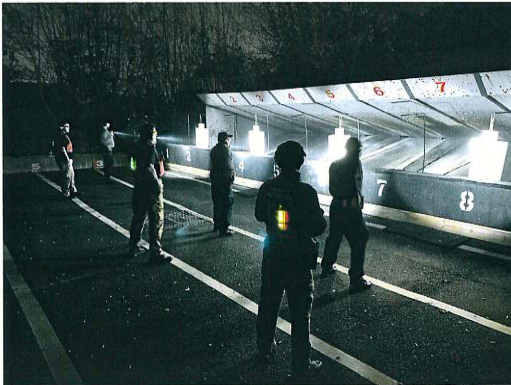
Low-light firearms training