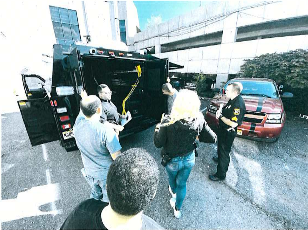
Incident Command Training