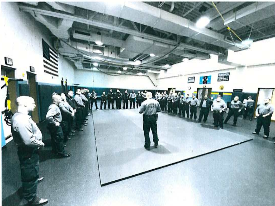
ARCON Arrest and Control Training