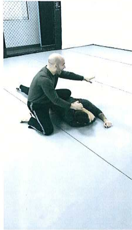
Probationary Officer Training Course POTC - ARCON Training